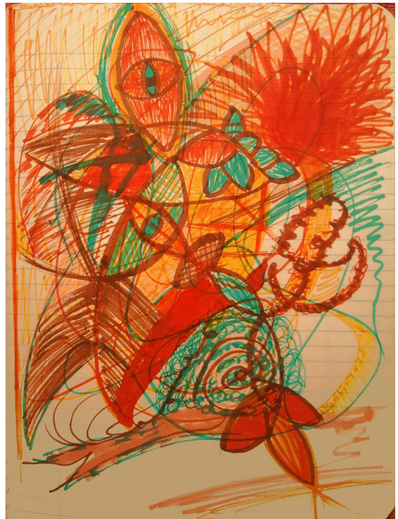
‘Concerning a Narrative of Pain’, Participant artwork

Facilitators can sometimes overshare, especially when in the presence of “quiet” participants, trying hard to “fill the gap.” It is better to find alternative ways of expression for those individuals who prefer not to talk openly about their thoughts, or who may not yet be prepared to elaborate their feelings. Having markers, pencils, sketchpads, mural paper, playdoh, or other tools for drawing, writing, or free expression is essential for individuals who feel anxious around other people but still wish to express their feelings.