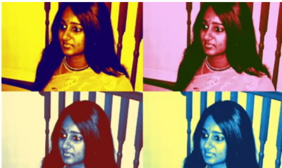
from Nanditha's Digital Story 'Disadvantage to Advantage'

Finger foods like crackers, fruit, veggies, and cheese work well. Keep in mind the dietary needs of your participants if they are not bringing their own snack. Even some brown bag lunches need to be safe for others to be in the same space with, as some may be allergic in the presence of certain foods like nuts.