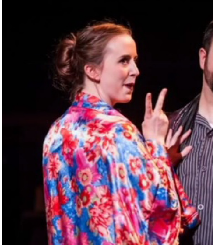
from Lindsay’s Digital Story ‘Hold Your Head High’

If there are many and various needs, it is also okay to be clear with the participants about not necessarily being able to meet all their needs in the given story circle session. Consider providing follow-up sessions or designing another session