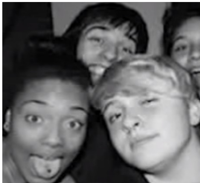
from Erin's Digital Story 'Becoming Me'

You may feel confident when you have the stage, and are an extrovert by nature. In this case, consider your dynamic within the group. Are you comfortable with the silences? Sometimes the silence is a catalyst for reflection and digestion of conversation that is deeply needed.